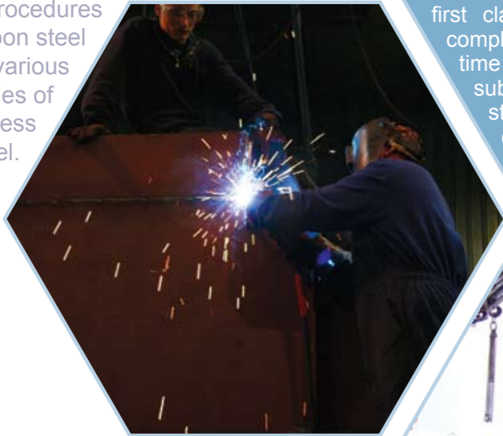
Welders coded to Asme 9.

Weld Procedures in carbon steel and various grades of Stainless Steel.